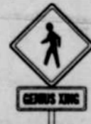
Reason # 48:

In Quitman, Georgia, it's against the law for a chicken to cross the road.