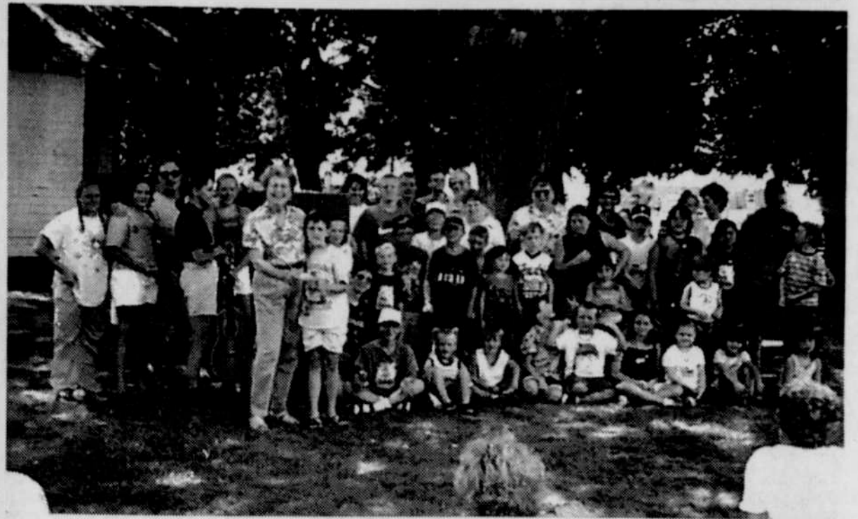
Children and teachers of the vacation Bible school jointly-sponsored by All Saints' Episcopal, Hope and Valby Lutheran and the United Methodist churches gather in the Heppner City Park as they conclude their week of activities on the last day of VBS on Friday, July 21.