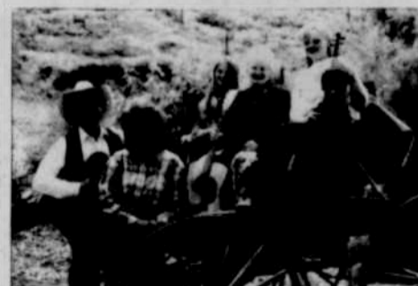
Severe Family, Pendleton Live Music