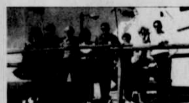
2000 Festival Square Dancers