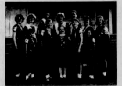
Roundup City Cloggers