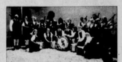
Scottish Bagpipe Dancers