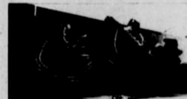
"Queztzalcoatl" Ballet Folklorico