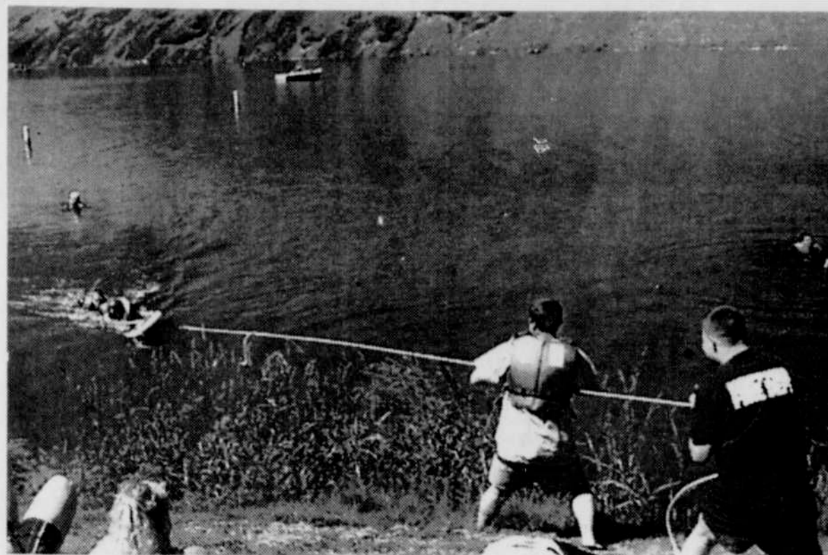
Local emergency personnel train at Willow Creek Lake in the use of water rescue gear and techniques. Here they use a sled with a rope attached to pull rescue swimmer and "victim" to shore.

Thanks to the efforts of local firefighters, the Morrow County Search & Rescue and the U.S. Army Corps of Engineers John Day Project, the Willow Creek Lake is now a safer place for boaters, fishermen and swimmers.