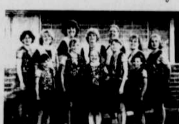
Roundup City Cloggers