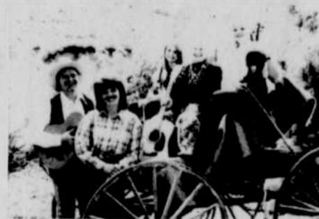
Severe Family, Pendleton Live Music

Where: Pendleton Convention Center When: Thursday, June 29th @ 8:00 P.M. Tickets: $8:00 per person at the door