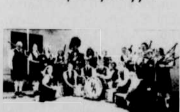
Scottish Bagpipe Dancers