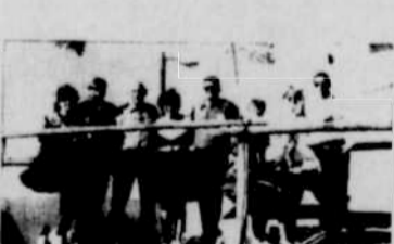
2000 Festival Square Dancers