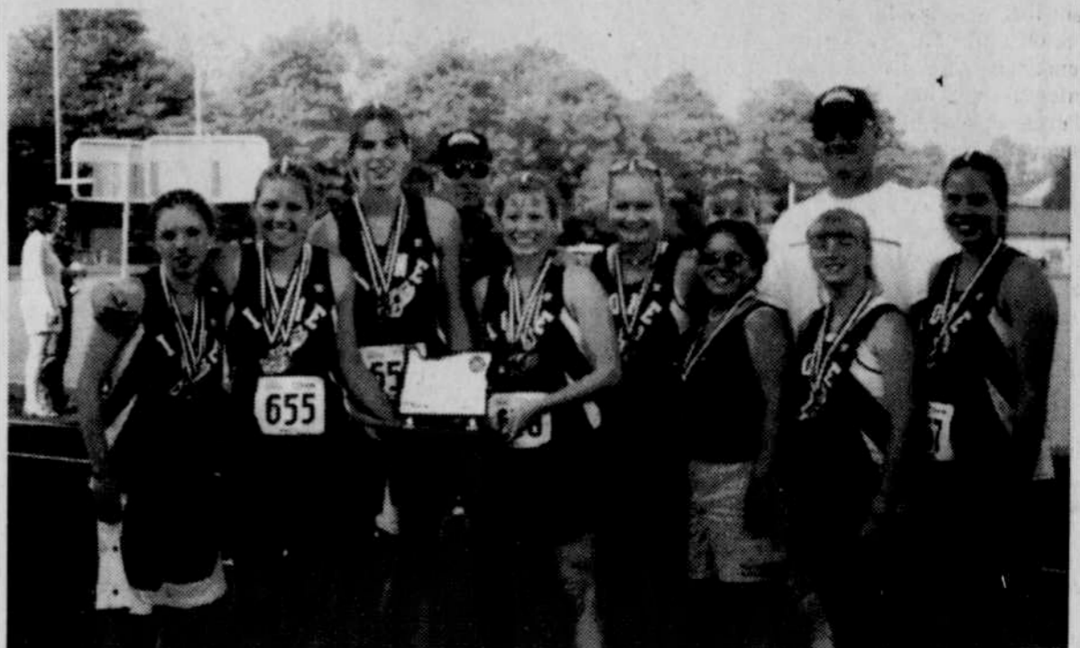
Lone girls' track team

The Lone girls track team finished second and the boys, third, at the state 1A meet held at Western Oregon University at Monmouth this past weekend.