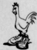
Reason # 47:

In Quitman, Georgia, it's against the law for a chicken to cross the road.