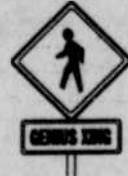
Reason # 48:

In Quitman, Georgia, it's against the law for a chicken to cross the road.