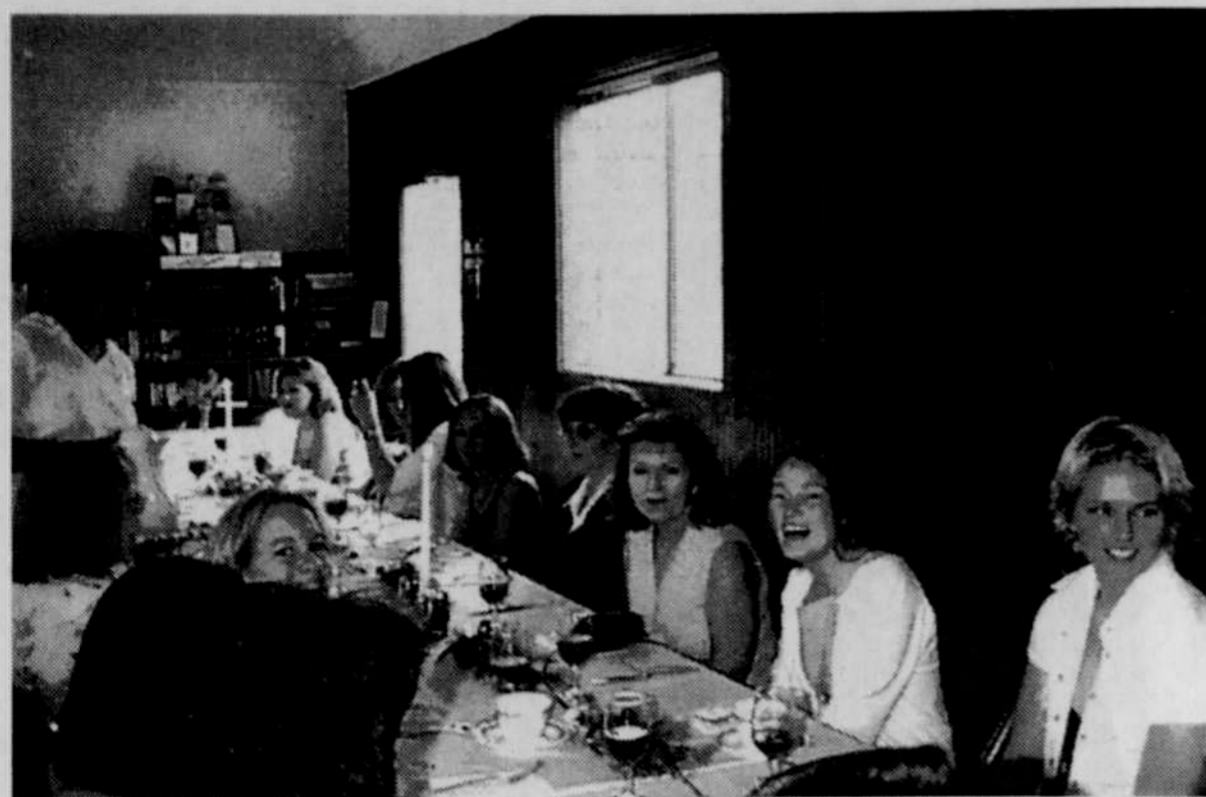
Heppner and lone senior girls and their mothers and guests enjoy the annual Senior Girls Luncheon on May 4 at All Saints' Episcopal Church in Heppner. The event is sponsored by the Willow Creek Service Club and catered by the All Saints' Episcopal Women.