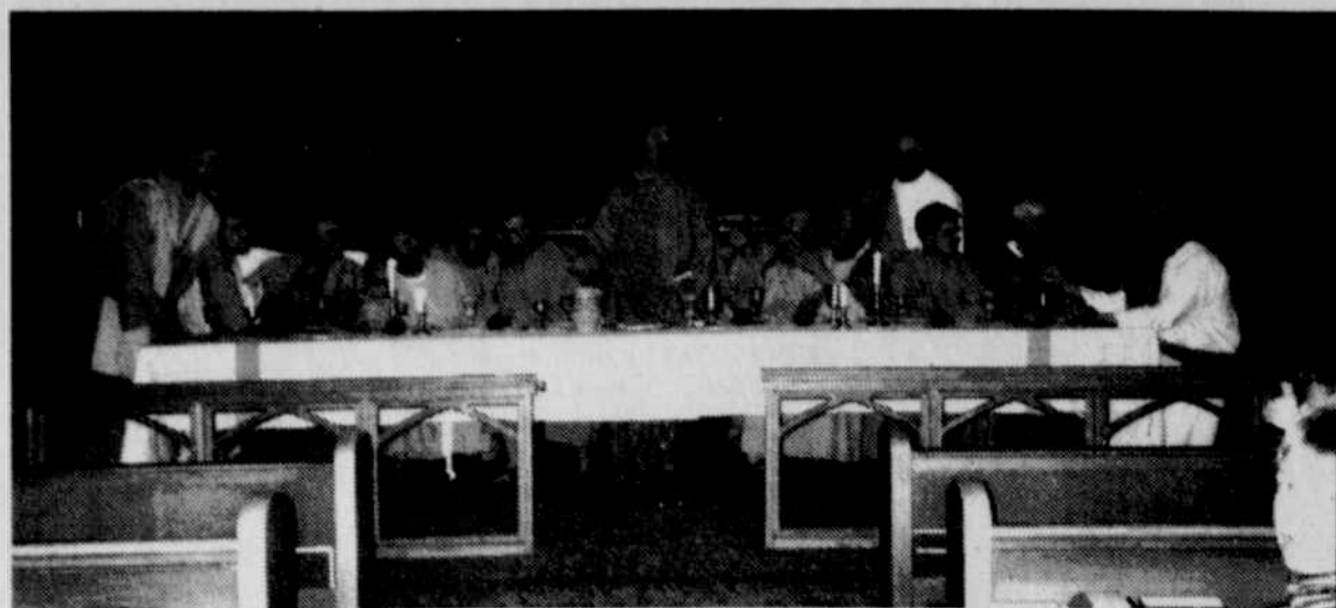
Lord's Supper tableau.

Again this year, the members of All Saints' Episcopal, Valby and Hope Lutheran churches will offer their Lord's Supper Tableau on Monday of Holy Week, April 17.