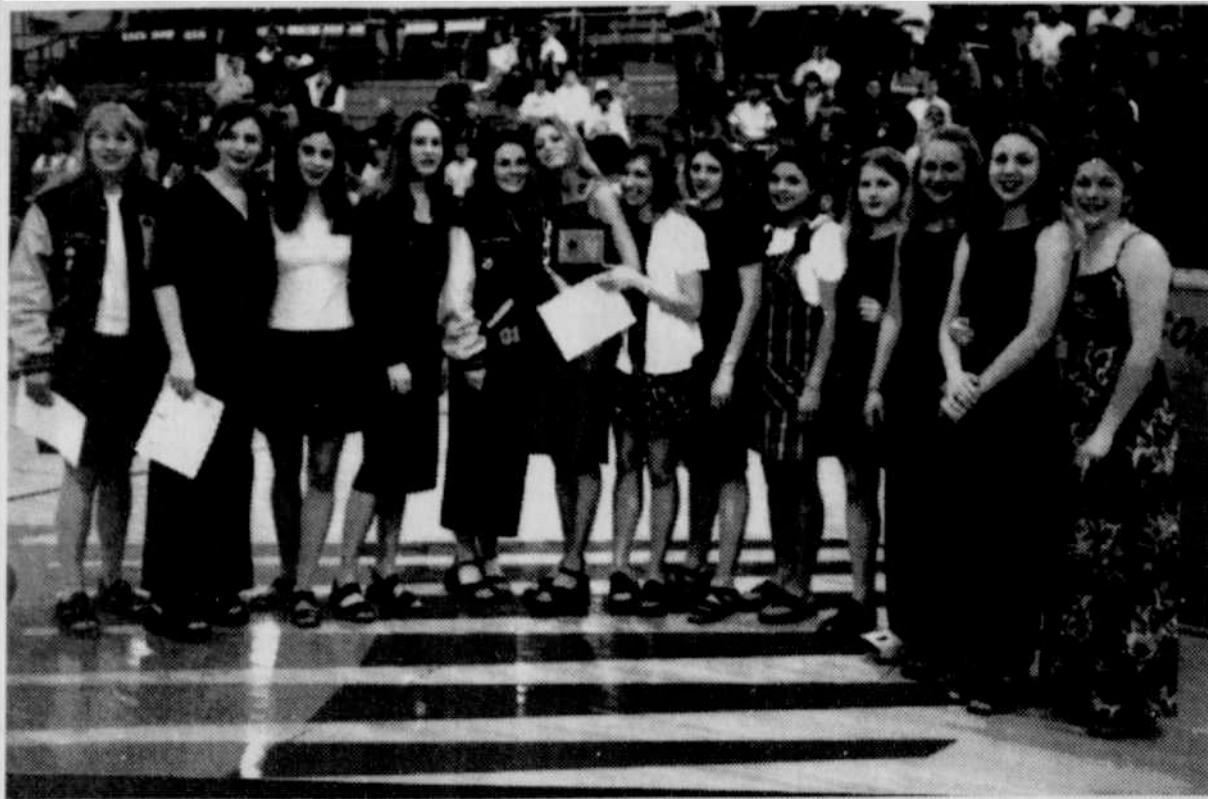
Mustang girls' basketball team takes second place in district tournament.