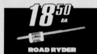
Our Most Popular Passenger Car Application

THRUST ALIGNMENT STANDARD ALIGNMENT 4 WHEEL ALIGNMENT (Shims included) 39 95 21 95 65 95