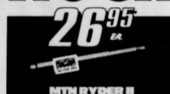
Our Most Popular Sport Utility and Mini Pickup Shock (2WD and 4WD)