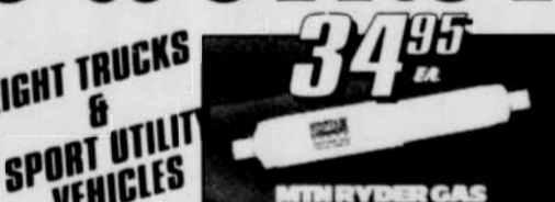
Our Most Popular Full Size Truck Application

STRUTS ARE AVAILABLE IN MOST APPLICATIONS Call for pricing on strut assemblies SHOCKS INSTALLATION IS EXTRA