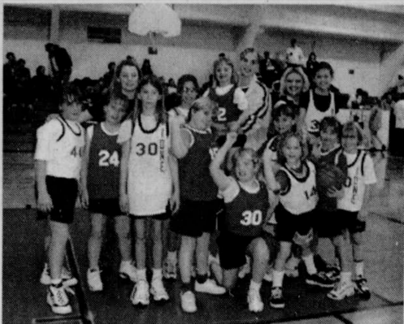
The Pee Wee girls basketball team shows its stuff