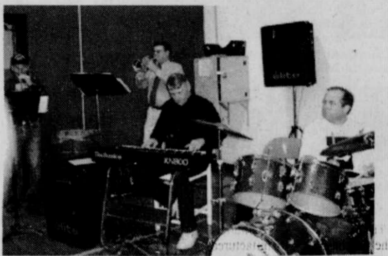
The ever popular Ione pep band entertains the crowds at home games