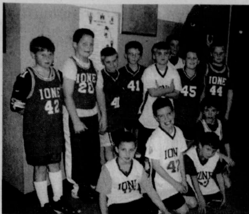
The Ione Pee Wee boys basketball team