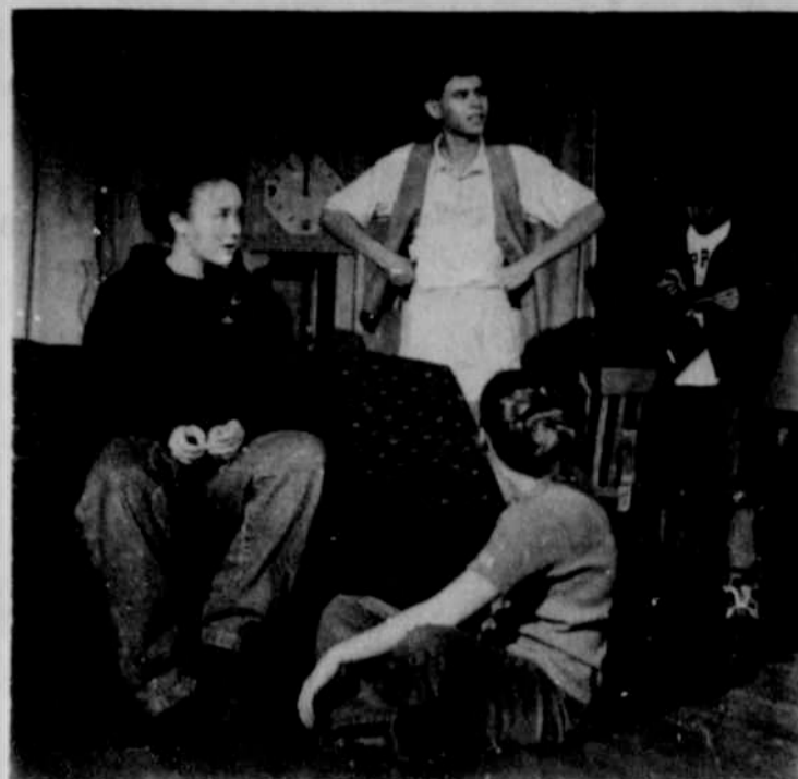
Heppner High School students rehearse 'The Miracle Worker' in preparation for their upcoming production.