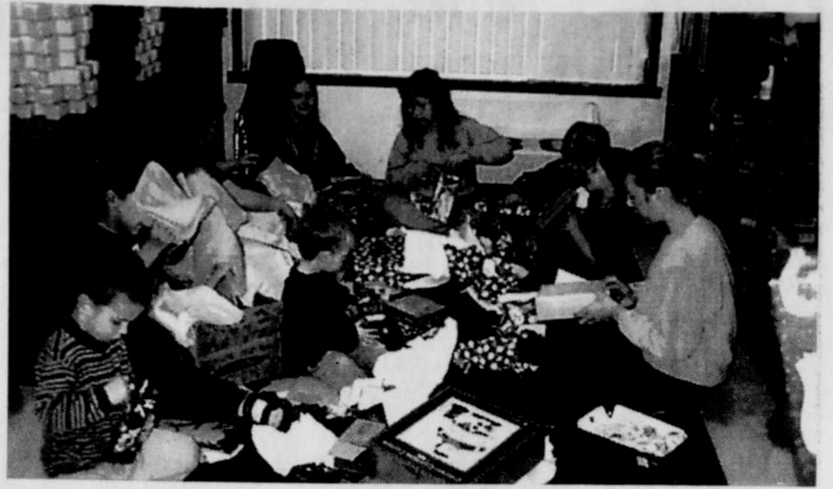
Gifts from the community: Heppner Day Care kids unwrap Christmas presents last week that were gifts of needed items from the community. The gift giving has become an annual event for the Day Care center.