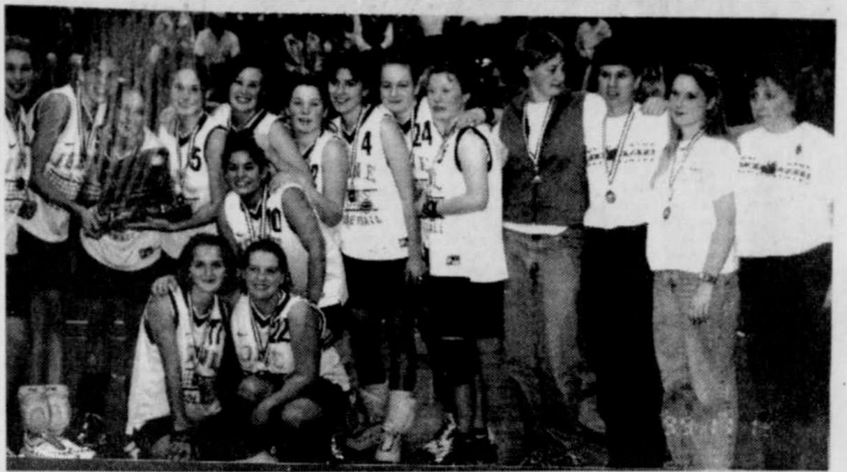
Ione Lady Cardinals- 1A State Volleyball Champions for the second year in a row