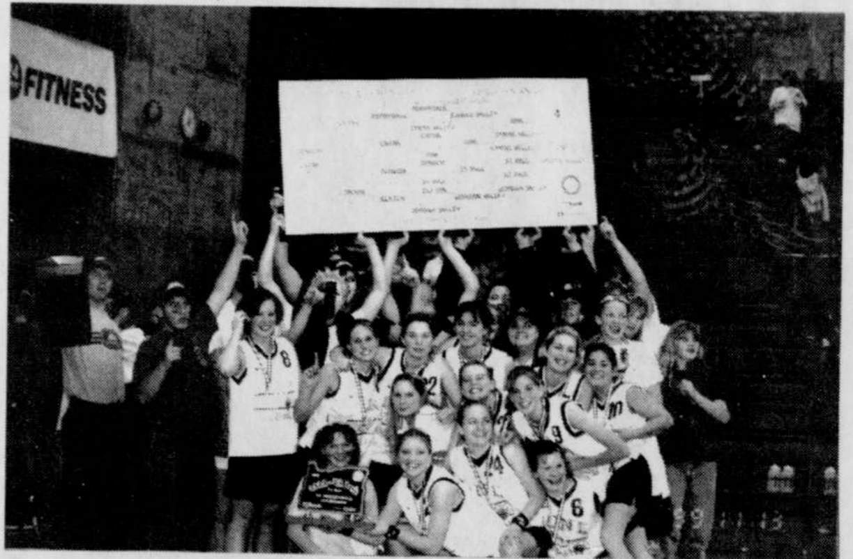
Ione lady Cardinals and fans display 1A State Volleyball Championship trophy and bracket board

Ione started off the OSAA State 1A Tournament, held Friday and Saturday, Nov. 12-13 at Lane Community College in Eugene, in grand style.