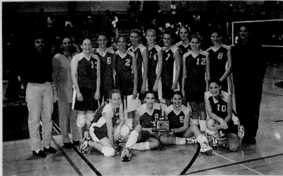
Mustangs show second place trophy at district tournament

Poor serving, which has plagued the Heppner Varsity Volleyball team off and on all season, lead to their defeat by the Sherman County Huskies at the Columbia Basin Conference playoffs held Saturday, November 6, at Weston-McEwen. The Mustangs lost to the Huskies, now number one in the league, 3-15, 6-15.