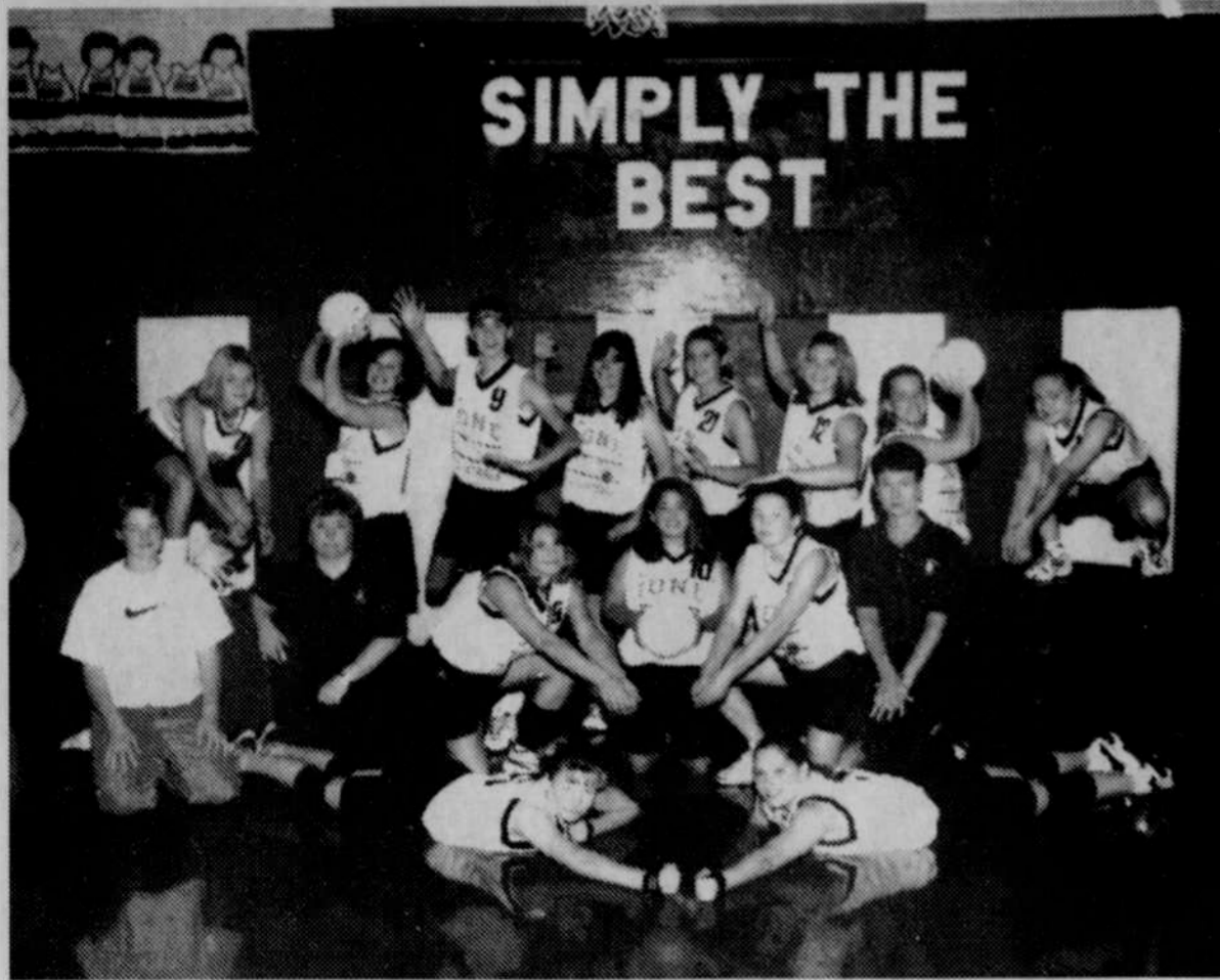
Ione Lady Cardinals 1999 Volleyball team