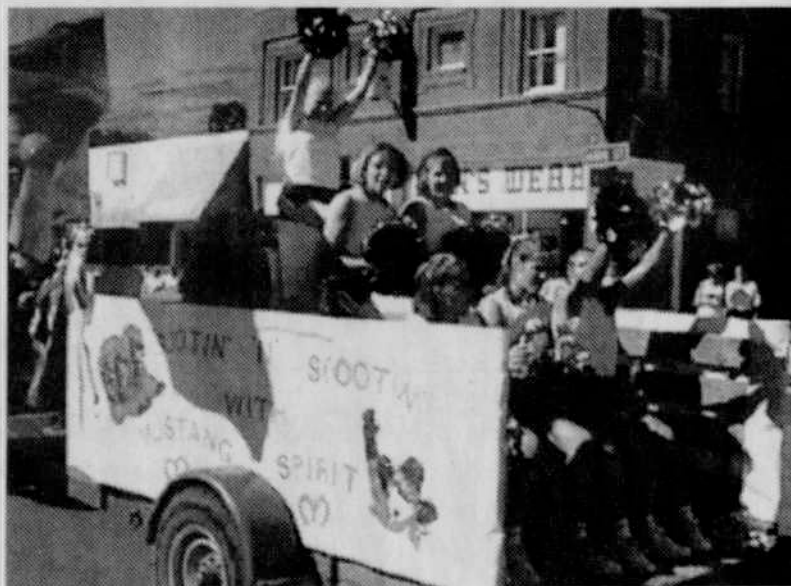
Heppner Mustang's cheerleader float