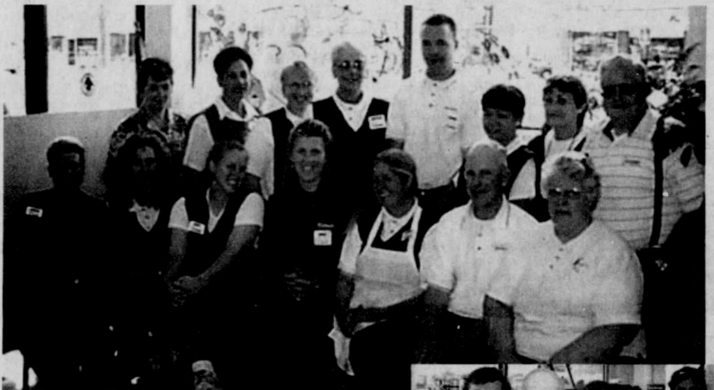
You will continue to see these familiar faces (except ours!) at the store every day!