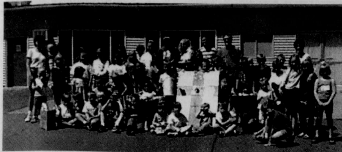
Children and helpers with the joint Episcopal, Lutheran and Methodist church-sponsored Bible school present donations of food and money to the Heppner Neighborhood Center.

Over 50 children attended vacation Bible school July 12-16 in Heppner.