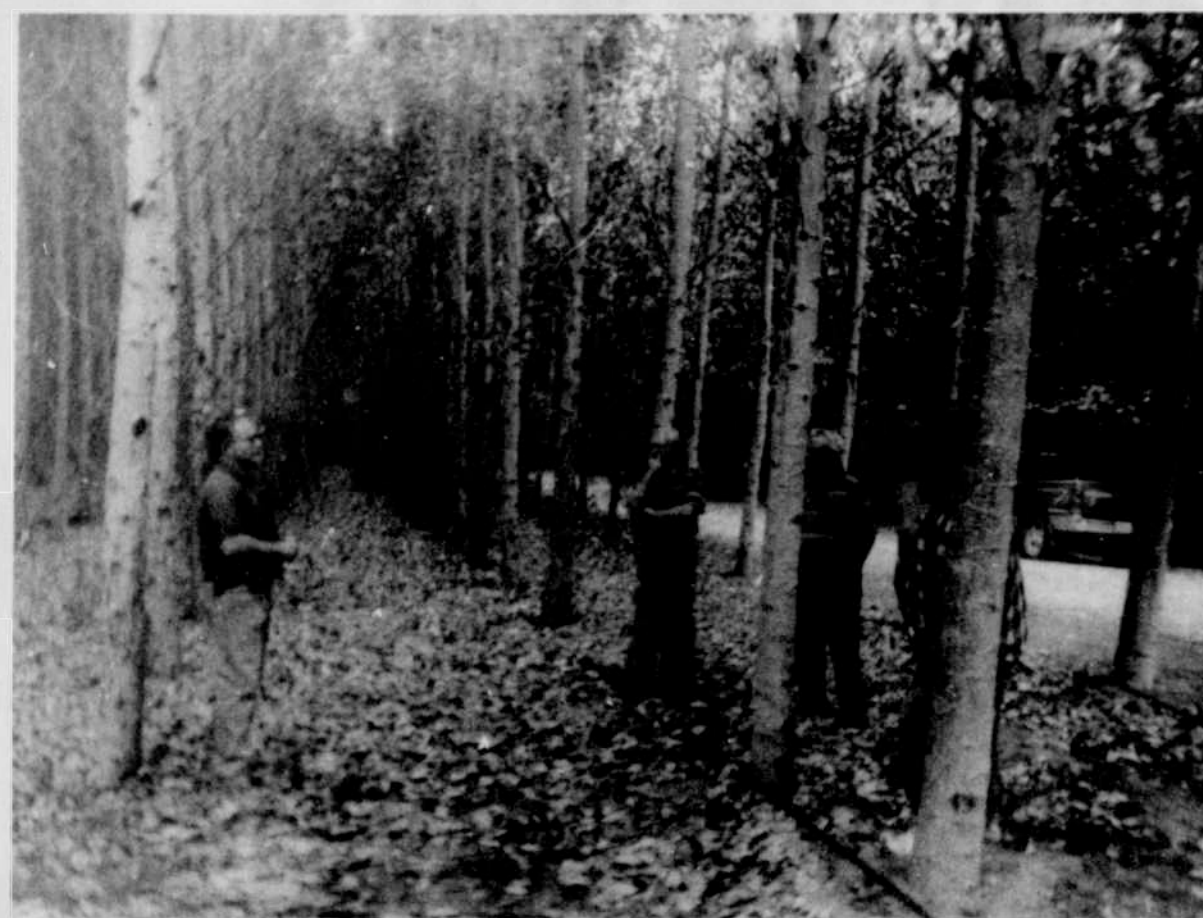
The Heppner Chamber of Commerce took a tour last Thursday of the Umatilla Army Depot and the Potlatch tree growing operation near Boardman.

The top picture shows chamber members looking over an empty igloo on the depot. Of the 1006 igloos on the depot, only 89 of them contain chemical weapons. The chamber also got a look at the construction site of the new chemical weapons disposal plant now under construction. The plant is expected to start operations in the year 2002 with completion of chemical destruction by 2005. There are two types of nerve gas and one type blister agent stored in one section of the depot. Projectiles, rockets, bombs and mines will also be destroyed at the disposal plant.