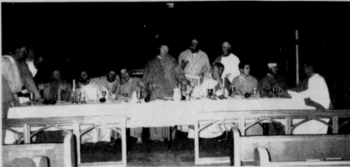
A tableau of the "Last Supper"