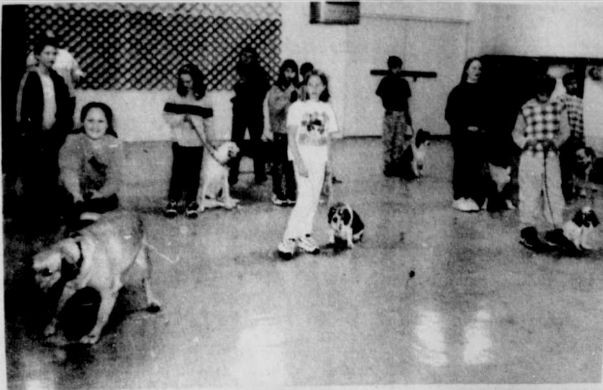
Dog 4-H group