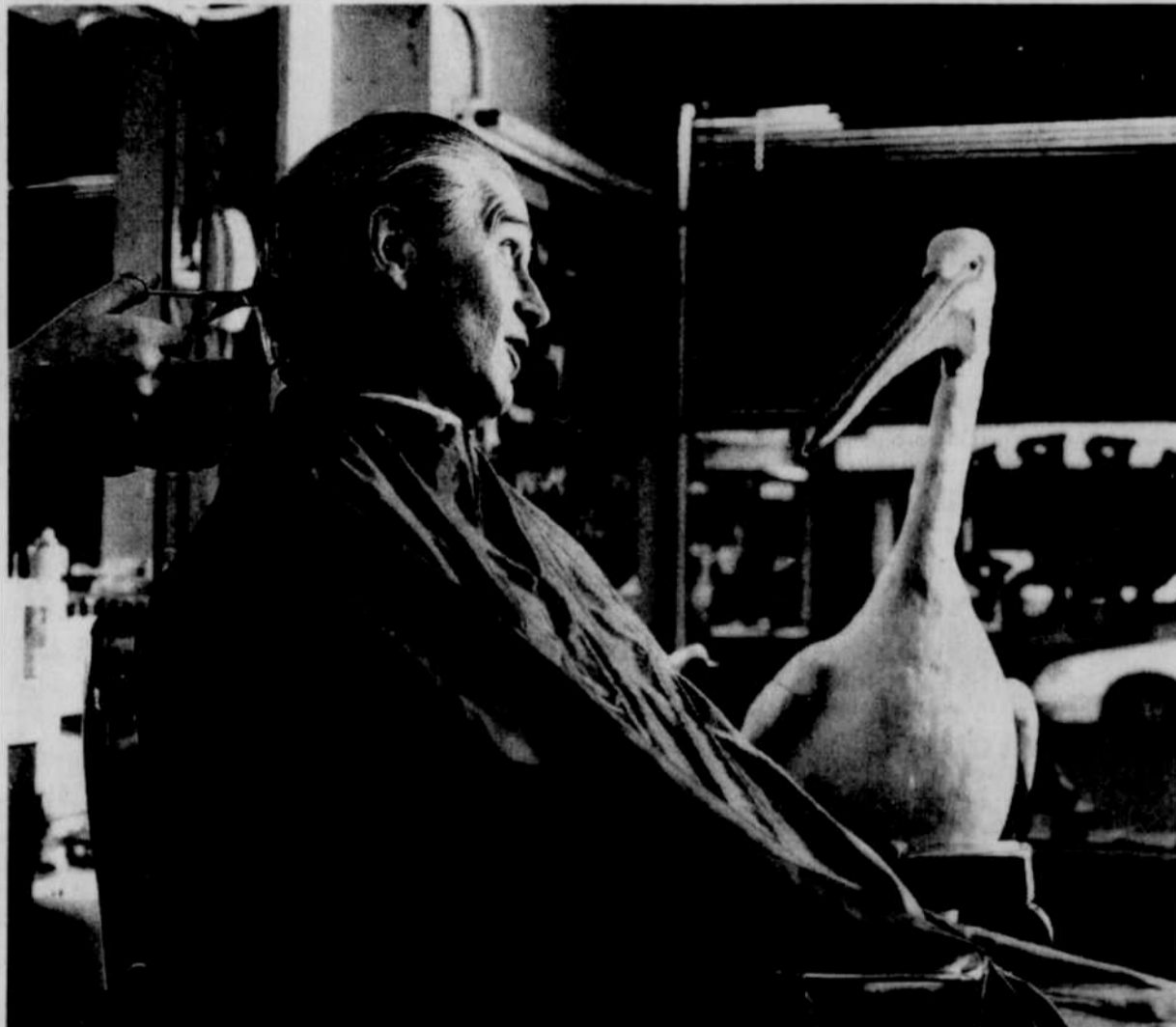
In Heppner at 111 N. Main Street, 541-676-5407.

BOWLING ALEY & DINER HOURS: 10 a.m. - 11 p.m.