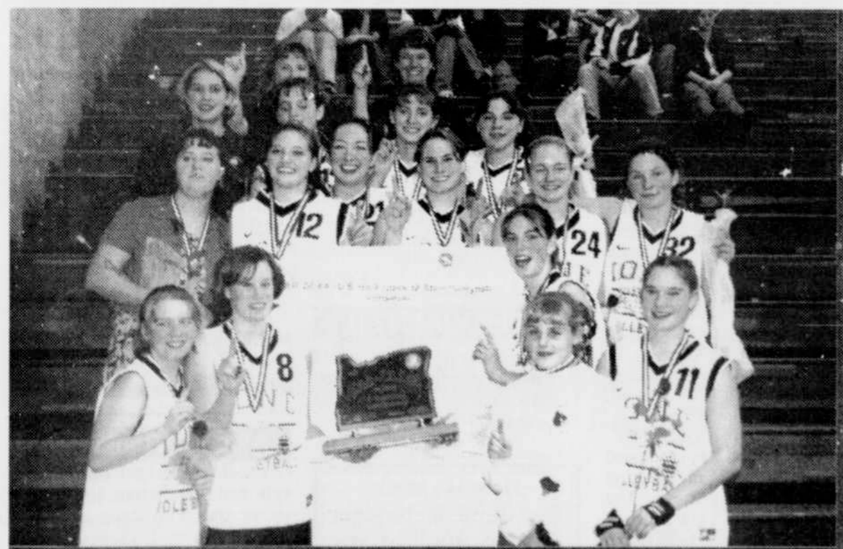
The lone Volleyball team takes the state 1A championship