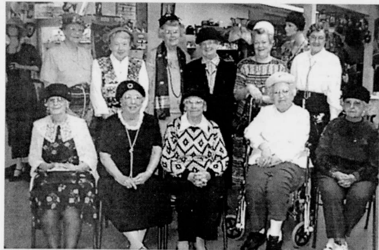
Heppner Bookworm Club members celebrate the 70th anniversary of the club