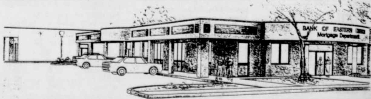
New addition to back of present bank building