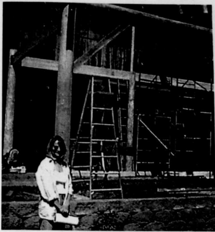
New stage constructed at lone amphitheatre