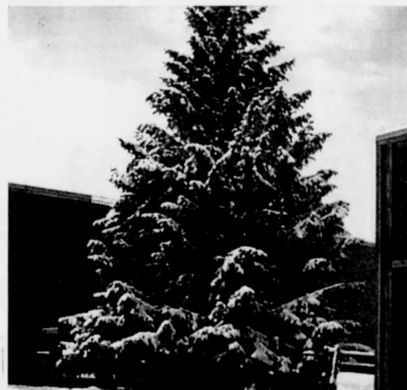
The downtown Christmas tree was flocked with snow when Heppner residents awoke Friday morning.

The city page was built and is maintained by the Heppner Gazette-Times.