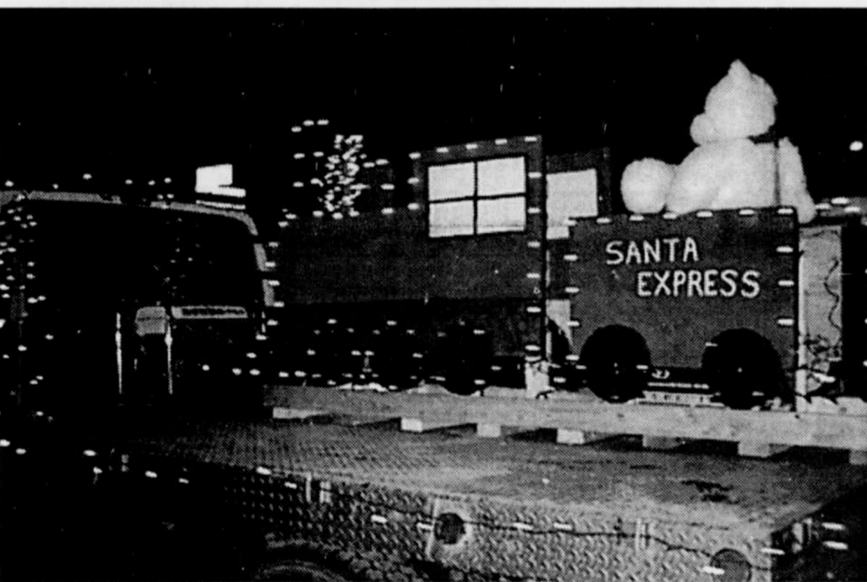
An entry in last year's Parade of Lights

The December calendar includes numerous local holiday events.