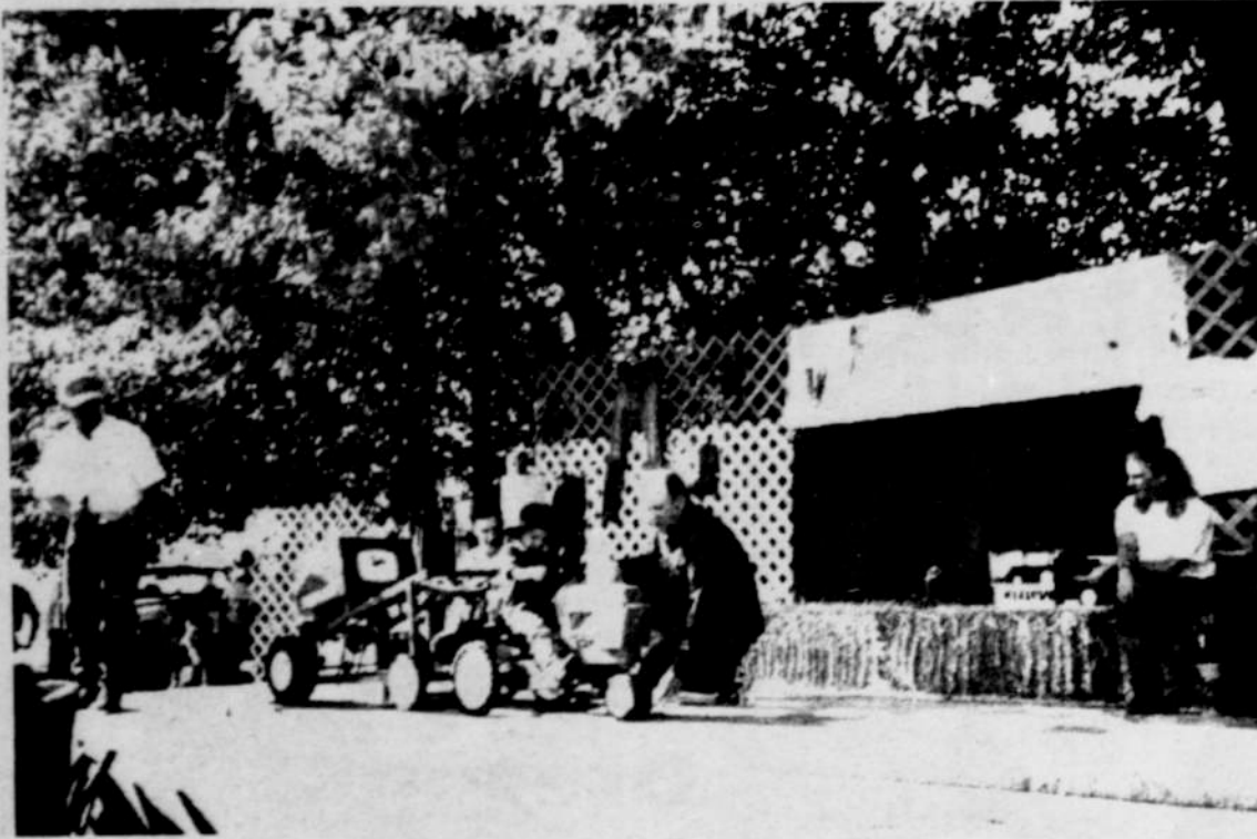
Tractor pull contest at the Morrow County Fair