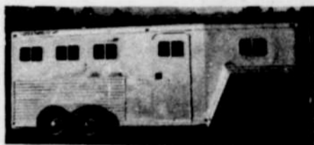
Featherlite Model 8546