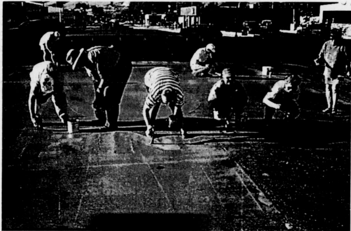
Volunteers paint the shamrock at the corner of Willow and Main streets in preparation for the Heppner celebration planned for Friday, July 31.