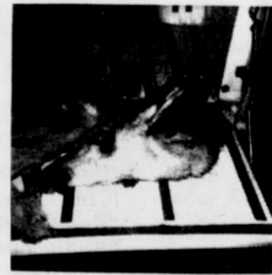
Illegally killed deer

Four people have been cited for killing a deer illegally on Little Buttercreek in Morrow County.