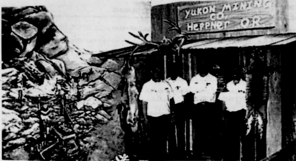
The local Les Schwab Tire Store has won first place for its display in the "Gold Rush Day's" promotion currently going on throughout the Les Schwab chain.