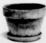
Yet to emerge

Oregon Lottery profits are available to go where they're needed, when they're needed. That's the beauty of it. In fact, this year alone, more than $350 million in Lottery profits are at work across Oregon. This includes $273 million for Oregon's public school and over $72 million for economic development programs. And in the future, Oregon voters can