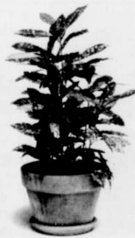
Education (Including Grades K-12 and Higher Education)

THE BASIC IDEA BEHIND LOTTERY FUNDING: WHEN SOMETHING NEEDS WATER, YOU WATER IT.