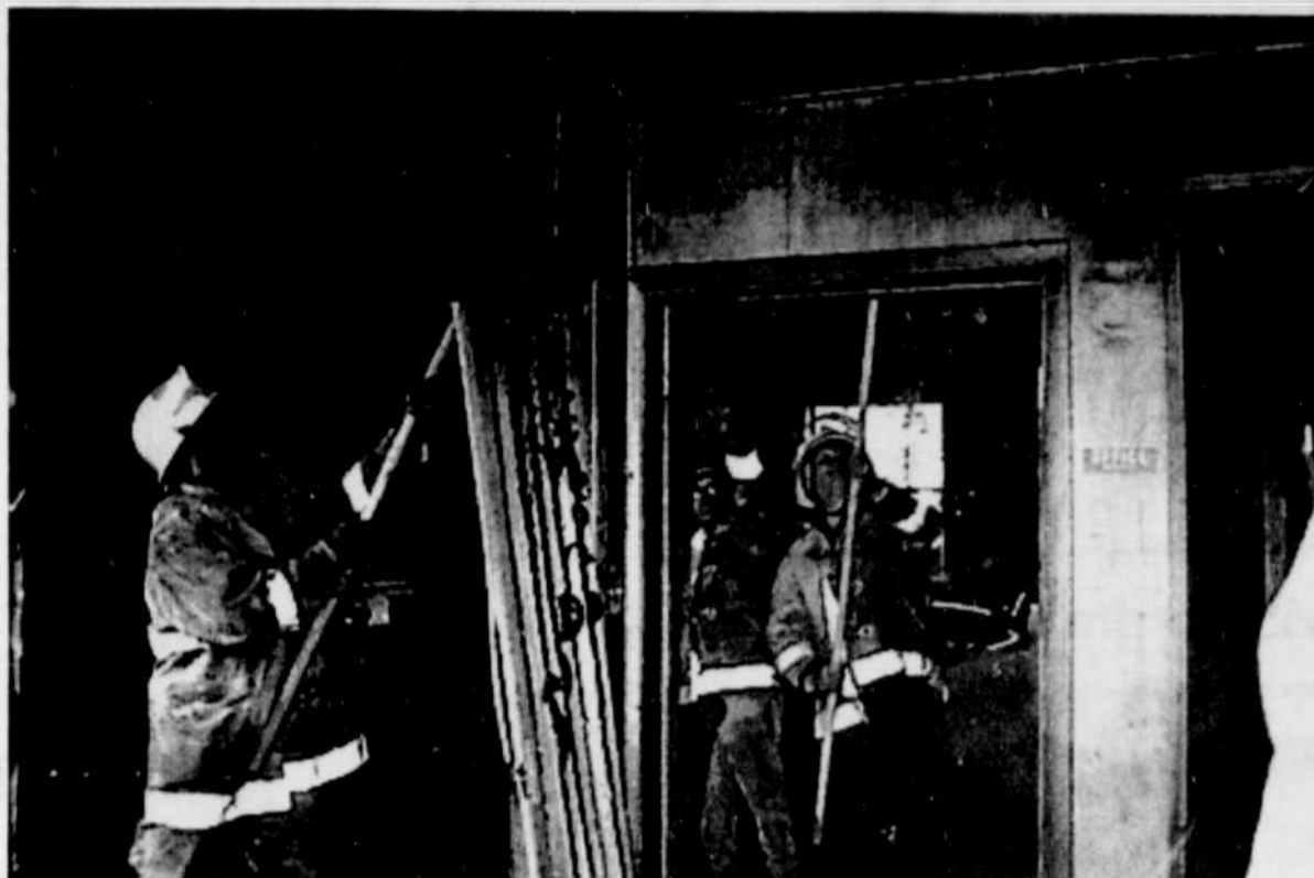
Firefighters pull down ceiling in IUCC