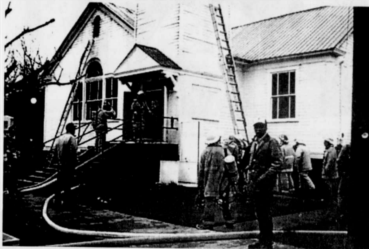
Ione United Church of Christ damaged in fire

The Ione United Church of Christ sustained smoke and heat damage in a fire which broke out around 4 p.m. on Thursday, April 23.