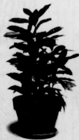
Education (Including Grades K-12 and Higher Education)

THE BASIC IDEA BEHIND LOTTERY FUNDING: WHEN SOMETHING NEEDS WATER, YOU WATER IT.