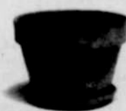
Yet to emerge

Oregon Lottery profits are available to go where they're needed, when they're needed. That's the beauty of it. In fact, this year alone, more than $350 million in Lottery profits are at work across Oregon. This includes $273 million for Oregon's public school and over $72 million for economic development programs. And in the future, Oregon voters can