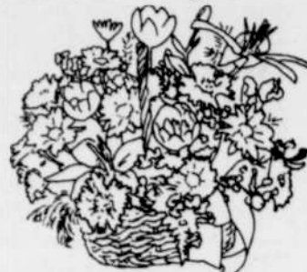
AFS "Spring Basket" Bouquet™

Welcome the freshness of spring and the joy of Easter with this radiant arrangement.