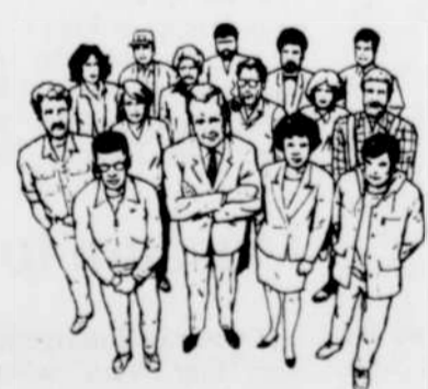
D. The People of Oregon

Luck has absolutely nothing to do with it. Instead, it's up to the people to decide. In 1984, Oregonians voted overwhelmingly to establish a state lottery, with profits directed to enhance economic development within our borders. In 1995, you voted again—this time to allow Lottery profits to help a public education system in need.