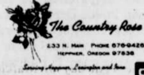
The Country Rose

We also have: Easter Lilies Easter Baskets