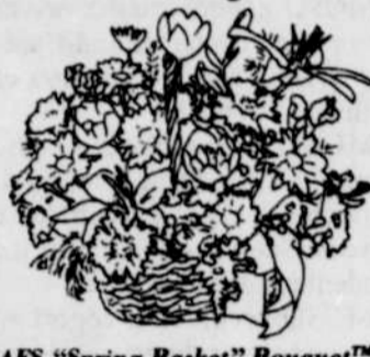
AFS "Spring Basket" Bouquet™

Welcome the freshness of spring and the joy of Easter with this radiant arrangement.