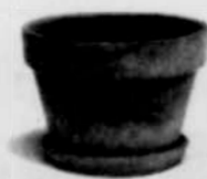
Yet to emerge

Oregon Lottery profits are available to go where they're needed, when they're needed. That's the beauty of it. In fact, this year alone, more than $350 million in Lottery profits are at work across Oregon. This includes $273 million for Oregon's public school and over $72 million for economic development programs. And in the future, Oregon voters can