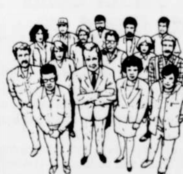
D. The People of Oregon

Luck has absolutely nothing to do with it. Instead, it's up to the people to decide. In 1984, Oregonians voted overwhelmingly to establish a state lottery, with profits directed to enhance economic development within our borders. In 1995, you voted again—this time to allow Lottery profits to help a public education system in need.