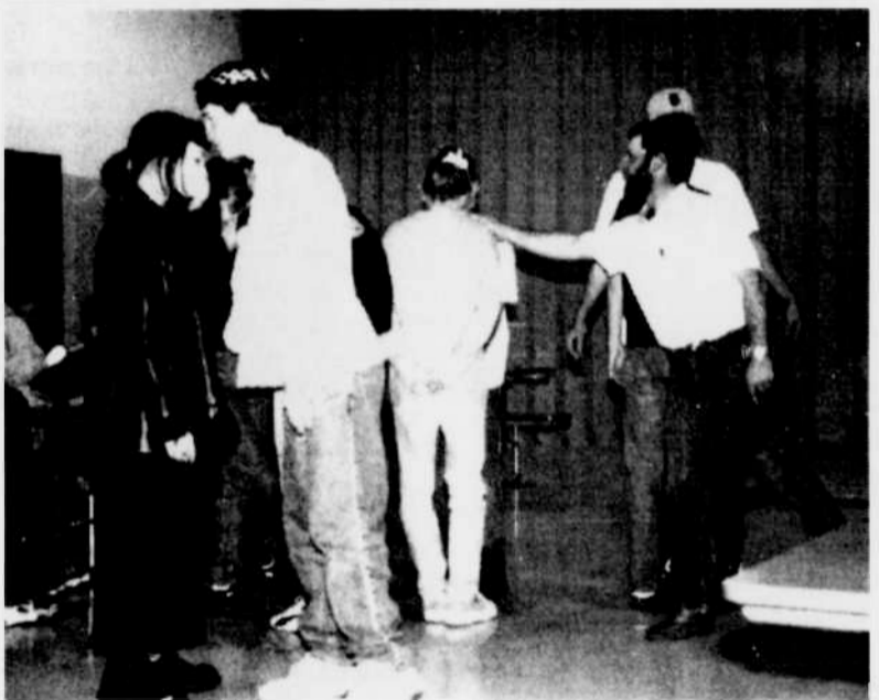
Teens enjoy at Campus Life Pig-Out

The Heppner Campus Life group held their Pizza Pig-Out Kick-Off Monday, Feb. 9. A total of 53 high school students participated, with 20 Papa Murphy's pizzas consumed. Campus Life is tied to Youth For Christ, a non-denominational Christian organization which has been reaching out to youth for 52 years. The Heppner Campus Life group is supported by several local community members, businesses and churches, with over $3,000 donated to the group last fall. A full-size bus has also been donated to the group, which will