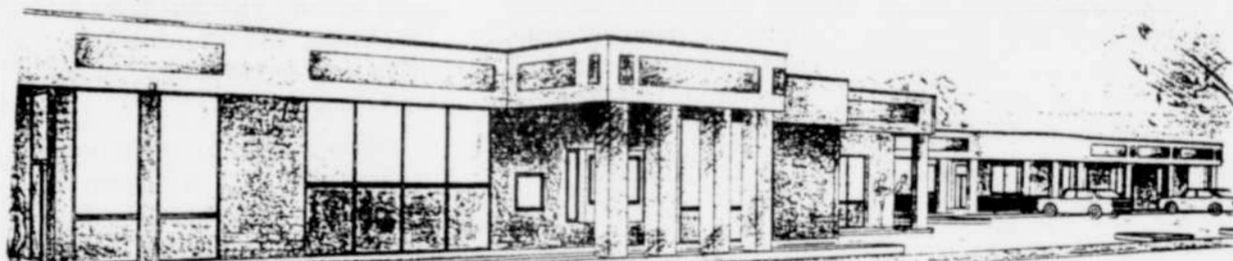
Front of existing bank