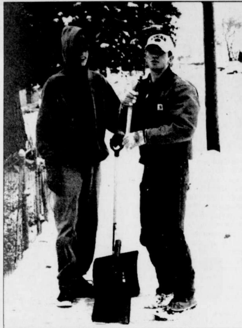
Shoveling snow for senior citizens.