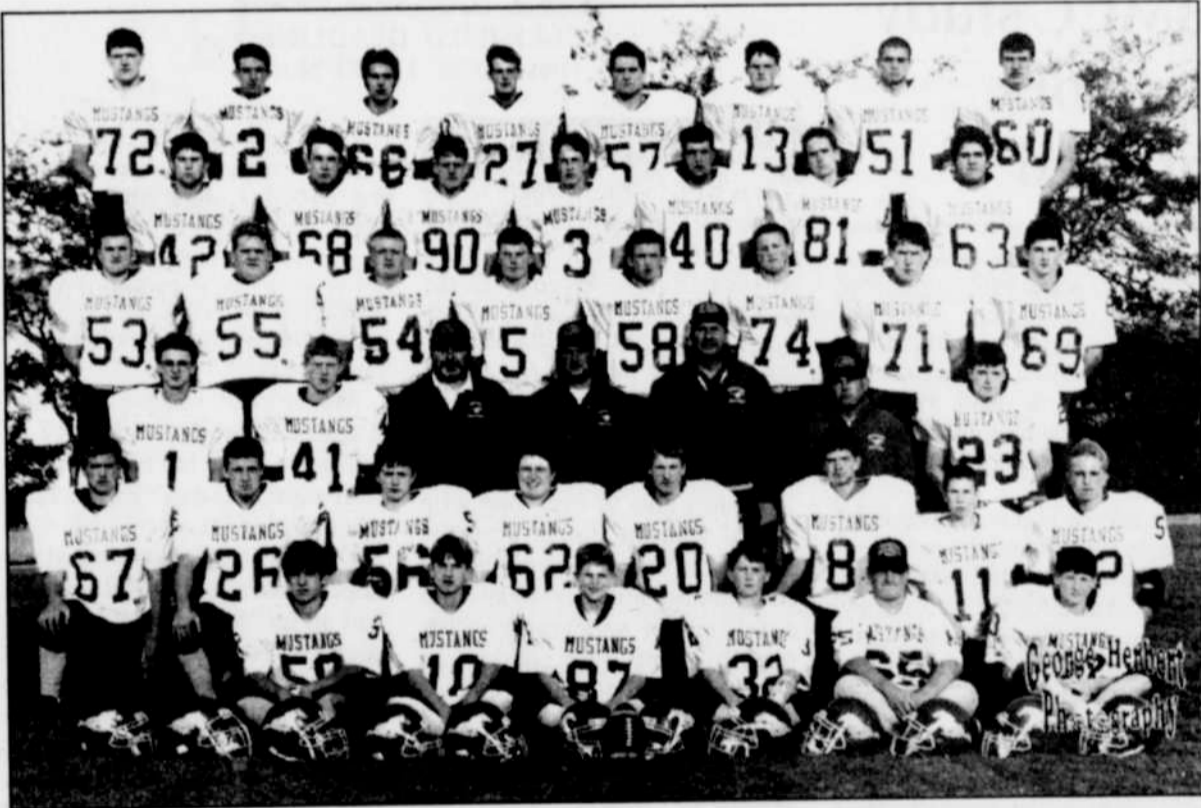
Mustang football team earns district title, heads to state