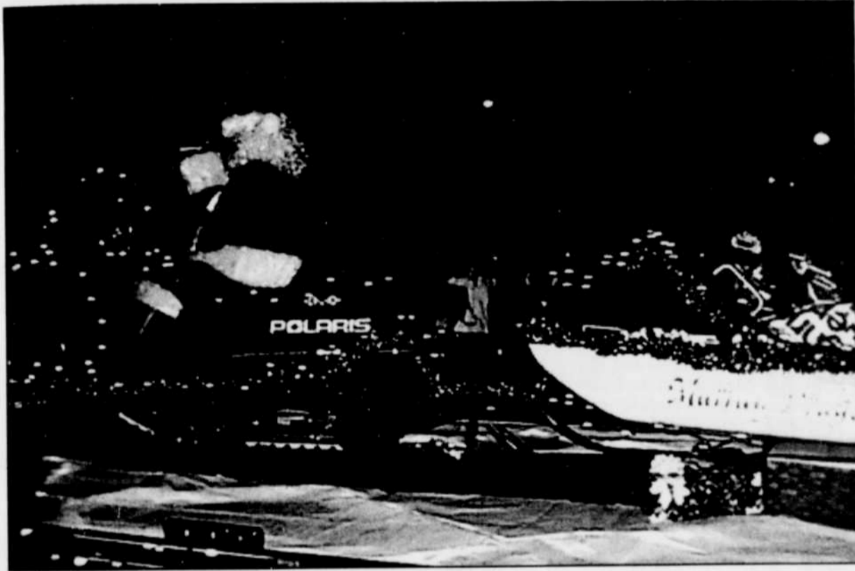
First annual Heppner Christmas light parade