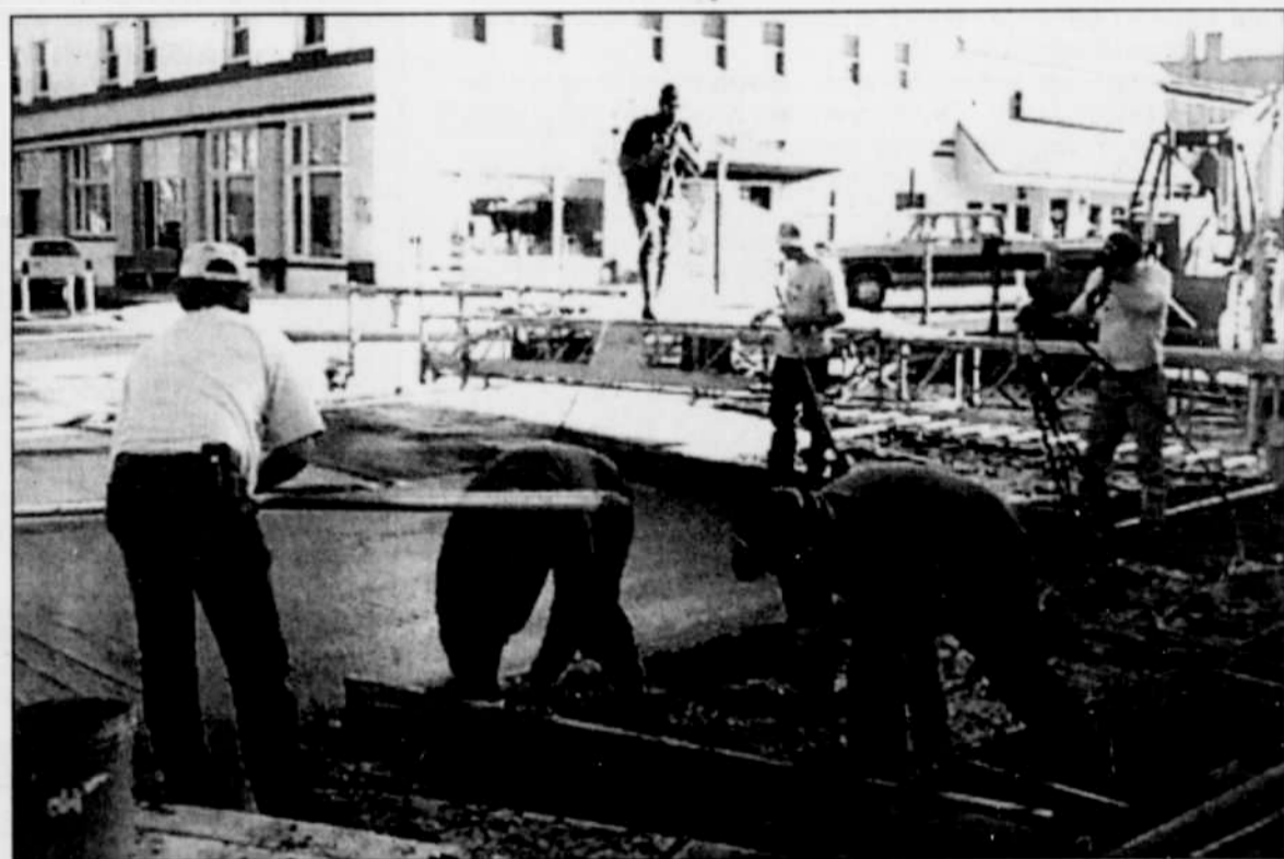
Workers repour cement for half of the city of Heppner's Main Street logo