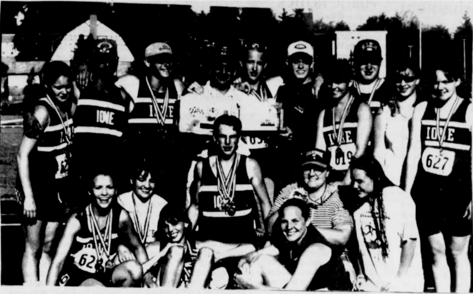
Ione High School track team takes first at state