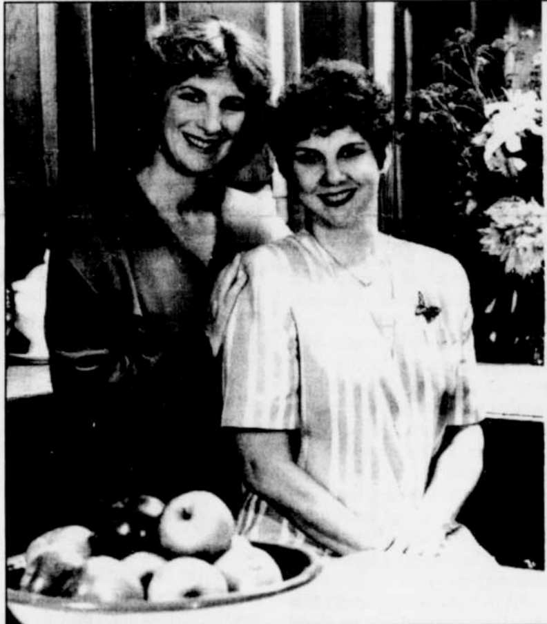
The Slob Sisters

The "Slob Sisters", who have helped "clutterbugs" all over the U.S. to organize their lives, will be the speakers at the Heppner Chamber of Commerce Town and Country Banquet set for Thursday, January 15, at the Heppner Elks Club.