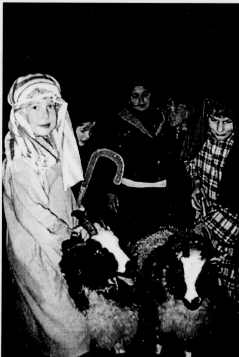
Hope Lutheran's living nativity

Anyone can enter, just pick up your punch card whenever you shop at any of the participating businesses, and for every five dollars in purchases at any participating business, get your card punched.