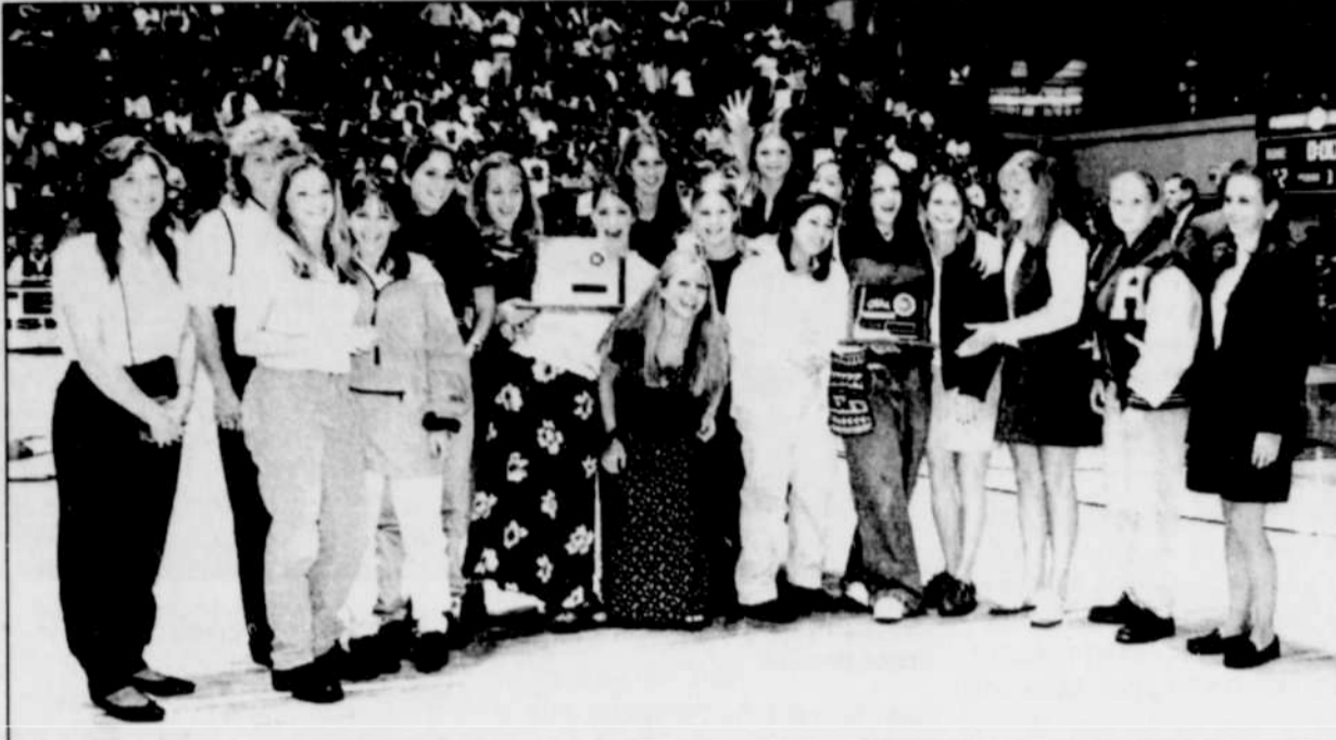
The Mustangs collect the fourth place trophy.