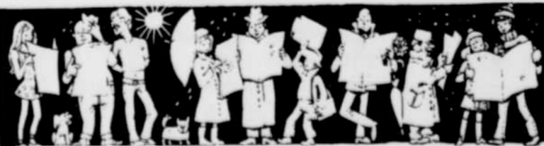
In the Gazette-Times, your ad is read!

Septic tanks pumped, residential and commercial Serving Morrow-Gilliam counties & surrounding areas 24 hour service • Licensed & Bonded • DEQ approved 676-5096 • Rt. 2, Box 2060 • Heppner # 37316 Speed rotor available • YOUR LOCAL SEPTIC SERVICE