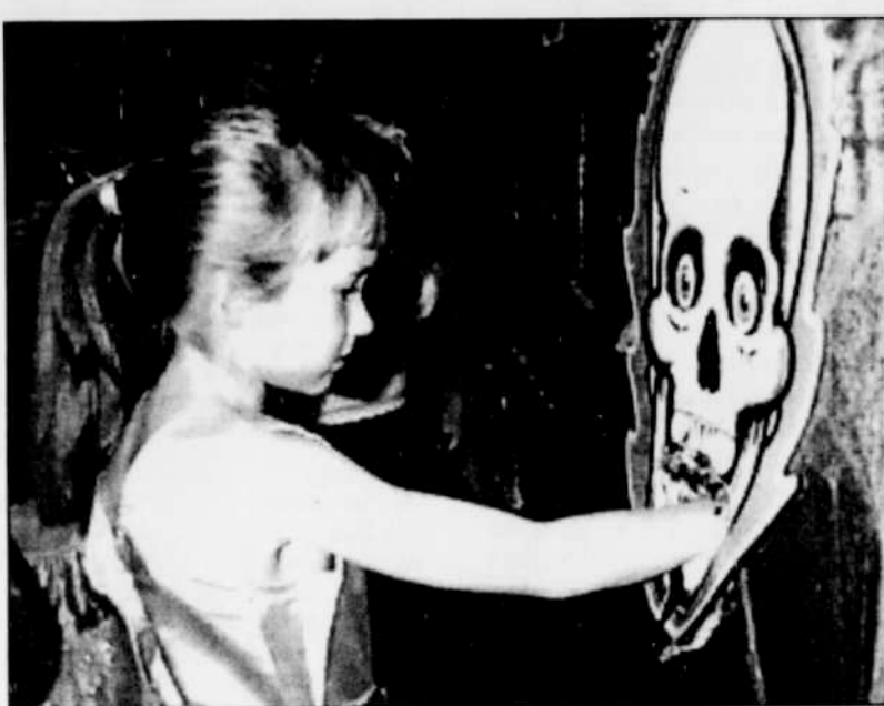
One little carnival goer is brave enough to stick her hand in the skeleton's mouth for a treat at the carnival.