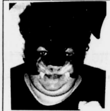
Willow Lanes Cafe