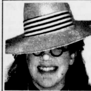
Bank of Eastern Oregon