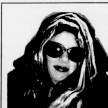
MC Abstract & Title