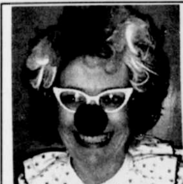
Van Marter & Kahl