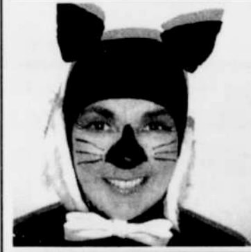
Coast to Coast