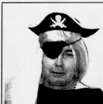
Klamath 1st Federal