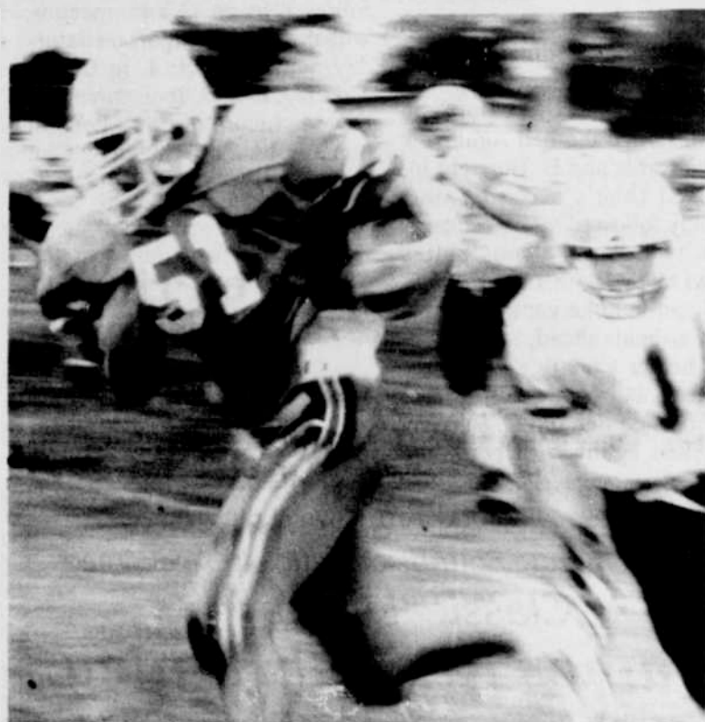
Cardinal runner picks up yardage

Ione got off to a rough start, but battled back only to come up short with a score of 48-30 against the Touchet Indians on Friday, Sept. 26, in non-league football play.